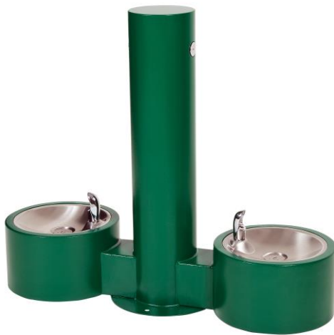
Top and Side Views:

The surface mount Dual Dog Watering Station is ideal for busy parks and thirsty pups. Featuring all stainless steel construction with 15 powder coat color options to choose from, the push button is proper height for ADA reach access guidelines. The unit is resistant to sunlight, heat, moisture and wear and offers optional freeze resistant valves.