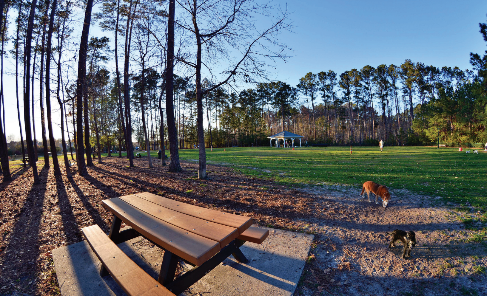
DOGGIE DELIGHT. The Sun City Hilton Head dog park is located on 2.24 acres in the heart of the active adult retirement community. The park opened in April 2003 and is visited by hundreds of dogs and their owners daily.

My thinking on that is it's related to changing demography. There are more people living alone now. Marriage is sort of less common. People are having fewer kids, they're getting married later, if they're getting married at all. More people are living longer."